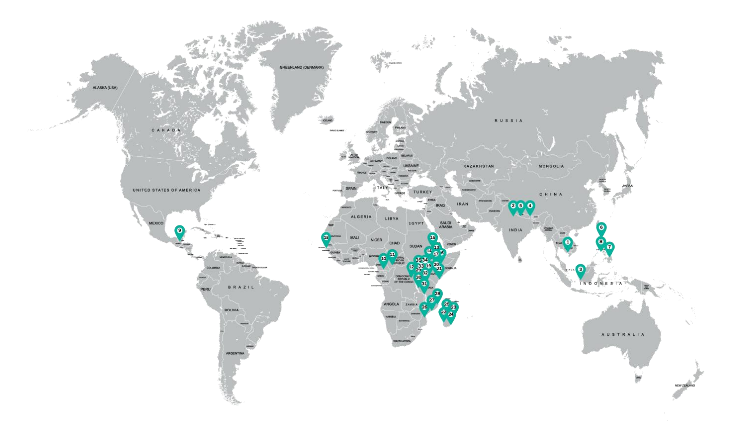
FIGURE 1 LOCATION OF PHE PROJECTS INCLUDED IN REPORT